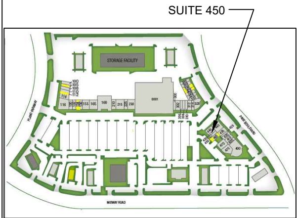
GROUND FLOOR KEY PLAN