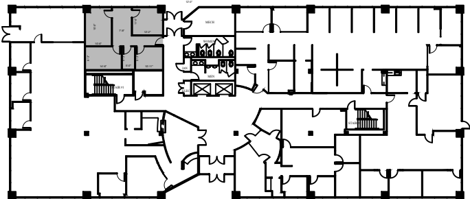
1st FLOOR KEY PLAN

SUITE 110 919 NRA 1 FLOOR PLAN SCALE: 1/8"=1'-0"